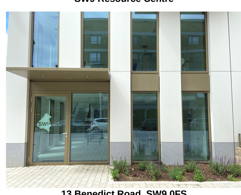
SW9 Resource Centre

SW9 manage two community spaces where we hold Resident Meetings, events and activities: