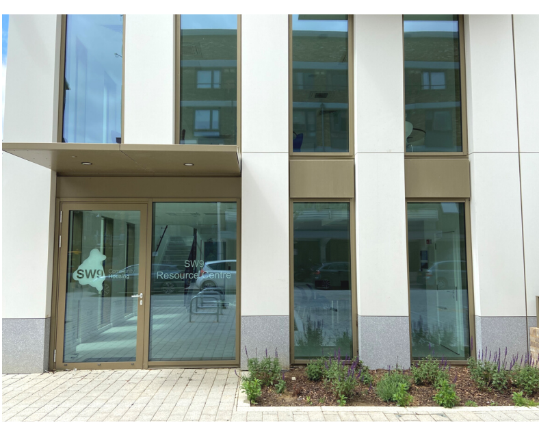
13 Benedict Road, SW9 0FS