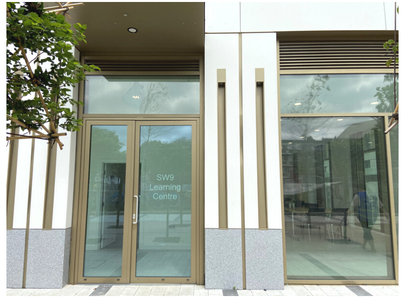
153 Stockwell Road, SW9 9FX